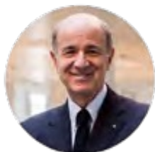
Corrado Passera Founder and CEO of Illimity