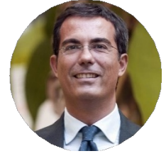
Giovanni Floris Journalist and TV host