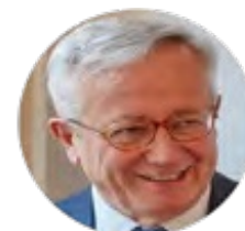
Giulio Tremonti President of Aspen