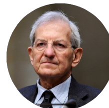
Luciano Violante President of Fondazione Leonardo – Civiltà delle Macchine