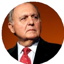
Paolo Savona President of CONSOB