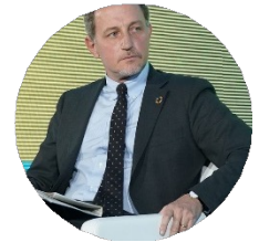
Massimo Giannini Writer and journalist