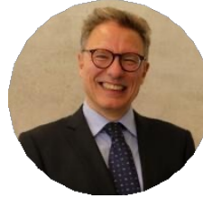
Luciano Floridi Professor and Founding Director of the Digital Ethics Center in Yale