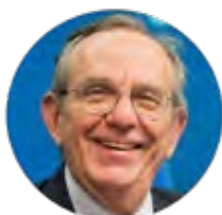
Pietro Carlo Padoan Presidente of UniCredit