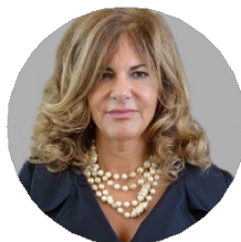
Emma Marcegaglia President and CEO of Marcegaglia Holding