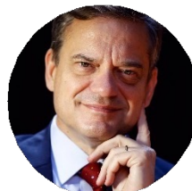
Lorenzo Bini Smaghi President of Société Générale