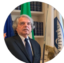
Renato Brunetta President of CNEL