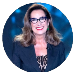
Cesara Buonamici Ad personam Director of TG5 Mediaset