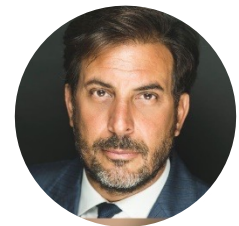
Federico CORNELLI Commissioner of CONSOB