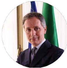
Saverio VALENTINO Component of Italian Competition Authority