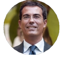
Giovanni Floris Journalist and TV host