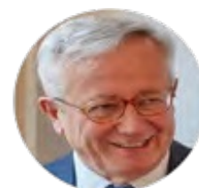
Giulio Tremonti President of Aspen