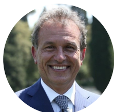
Vito Cozzoli CEO of Autostrade dello Stato