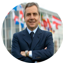
Dario Scannapieco CEO of Cassa Depositi e Prestiti