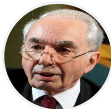
Giuliano Amato President Emeritus of the Constitutional Court

The High-Level Steering Committee will carry out all the tasks relating to the strategic-didactic direction and orientation function through the annual drafting of some guidelines for the higher education path.