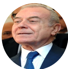
Gianni Letta Honorary President Guido Carli Foundation