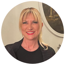
Silvia CASTAGNA Member of AI Commission in Department for information and publishing of Presidency of Council of Ministers