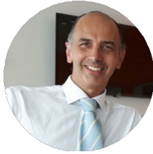
Federico Eichberg Chief Cabinet of Ministry of Enterprises and Made in Italy