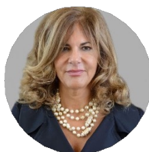
Emma Marcegaglia President and CEO of Marcegaglia Holding