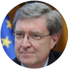
ENRICO GIOVANNINI PRESIDENT