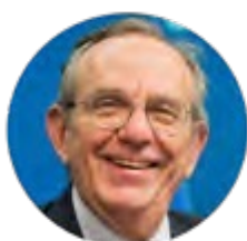
Pietro Carlo Padoan Presidente of UniCredit