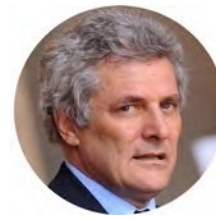
Alain Elkann Writer and journalist