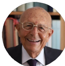
Sabino Cassese Constitutionalist