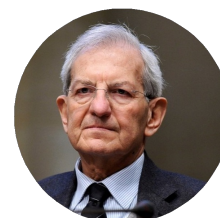
Luciano Violante President of Fondazione Leonardo – Civiltà delle Macchine