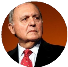
Paolo Savona President of CONSOB