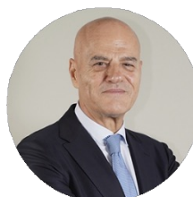
Claudio Descalzi CEO of Eni