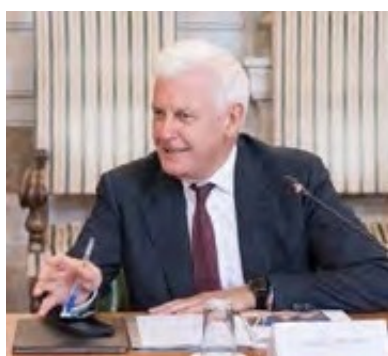
A. Profumo, CEO of Leonardo