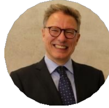
Luciano Floridi Professor and Founding Director of the Digital Ethics Center in Yale