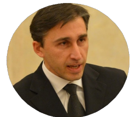
Renato LOIERO Counselor of the President of the Council of Ministers