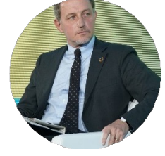
Massimo Giannini Writer and journalist