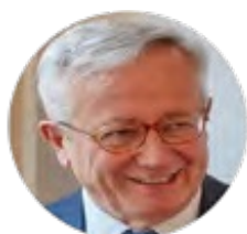
Giulio Tremonti President of Aspen