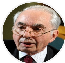
Giuliano Amato President Emeritus of the Constitutional Court

The High-Level Committee will carry out all the tasks relating to the strategic-didactic direction and orientation function through the annual drafting of some guidelines for the higher education path.