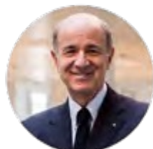
Corrado Passera Founder and CEO of Illimity