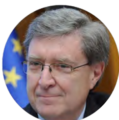
ENRICO GIOVANNINI PRESIDENT