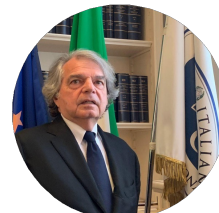
Renato Brunetta President of CNEL