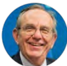
Pietro Carlo Padoan Presidente of UniCredit