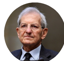
Luciano Violante President of Fondazione Leonardo – Civiltà delle Macchine