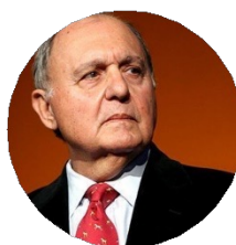
Paolo Savona President of CONSOB