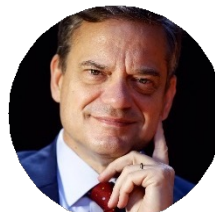
Lorenzo Bini Smaghi President of Société Générale